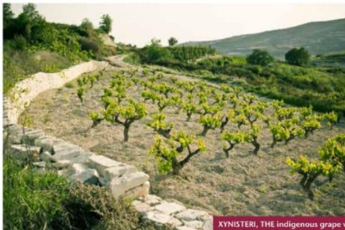
XYNISTERI, THE indigenous grape variety, in the Zambartas Mandria vineyard.